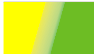
Yellow-green Applied to earth terminal