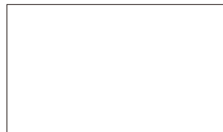
White Similar to RAL1102