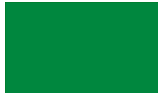
Green Similar to RAL6018