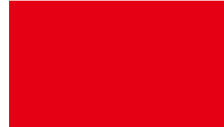
Red Similar to RAL3013